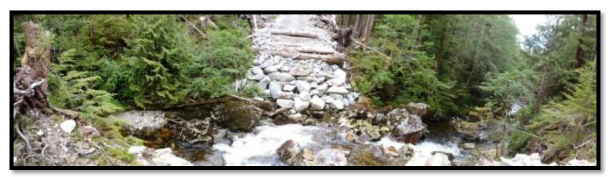
Deactivated bridge site on Naysash Creek.

No concerns were identified with road construction, maintenance or deactivation. Roads were stable and stream crossings were well maintained and in good condition. Roads were deactivated soon after harvesting, before equipment had left the area.