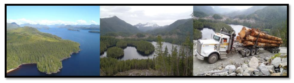
Typical variable terrain and fjords in the Mid-Coast TSA, recent timber harvest and log hauling near Sandell Lake.

Additional information about the Board's compliance audit process is provided in Appendix 1.