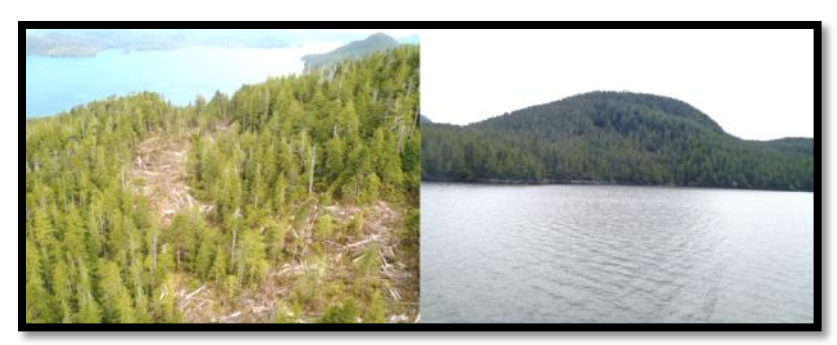
An example where harvesting small patches, retaining trees and using topographic screening reduced visual impacts in a scenic area.

Forest management for viewscapes is an important consideration in this area, especially for tourism operators. Interfor used visual design practices in scenic areas, including a combination of small patch cuts, careful orientation of cutblock boundaries, and tree retention, to well manage visual quality objectives.