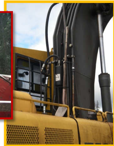
FIGURE 4. Shovel mounted directly to a feller buncher.