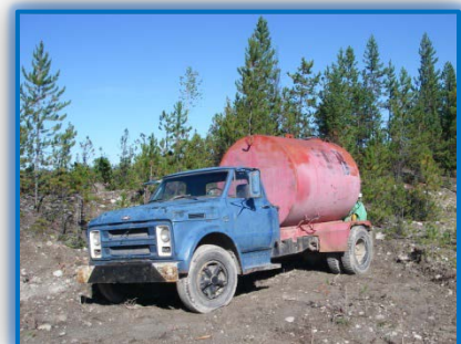
FIGURE 8. Water tank truck.

Persons conducting a high-risk activity when there is a risk of a fire starting or spreading must keep an adequate fire suppression system at the activity site. Without exception, all of the systems encountered consisted of a water source, pump, hose and accessories such as a nozzle, otherwise known as a water delivery system. Occasionally foam will be added to the water to stretch its fire-fighting power, doubling its effectiveness.