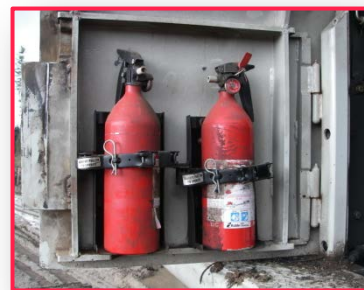
FIGURE 13. Fire extinguishers mounted on an excavator.

Attach hand tools directly to machines and equip pick-ups with a shovel, Pulaski and a full and functional hand tank pump to ensure that there will always be enough tools for each worker even if individual tools are lost or broken.