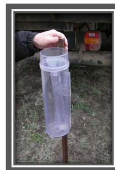
FIGURE 6. A rain gauge.

Once the representative weather station is selected, Tolko’s contractors record precipitation using rain gauges at the activity site. The rainfall amount is radioed to the office where the danger class is calculated based on the precipitation and temperature at the site and the relative humidity and wind speed data from the representative weather station. This calculation can be done using either computer software or tables.