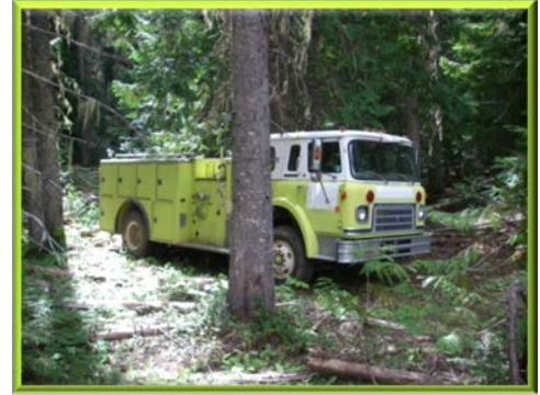
FIGURE 9. Retired municipal fire truck used as part of a fire-suppression system.

In general, licensees want to be able to get water to any part of the activity site to extinguish a fire. WMB guidance suggests that a suppression system using water should be nearby, operational and capable of being deployed in a reasonable amount of time, taking danger class into consideration. This suggests that readiness should escalate as danger class increases and that water should be closer when the danger class is higher. In practice, water tanks are often positioned on the road at the entrance to a cutblock, or in a central location when more than one site is active.