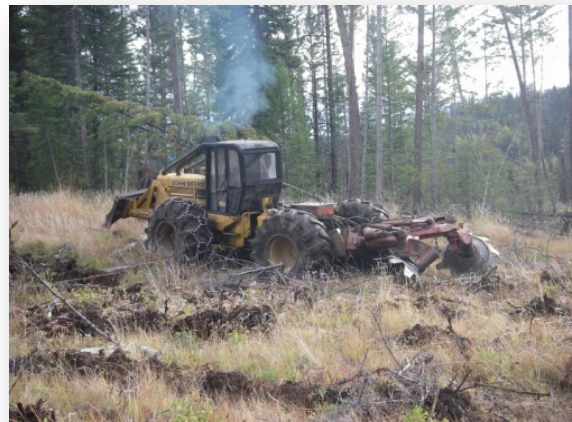
FIGURE 2. Disc trenching is a high risk activity.

For complete fire-preparedness requirements, please refer directly to the Wildfire Act v and the Wildfire Regulation . vi