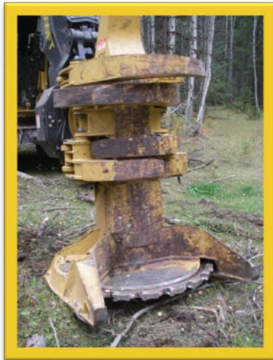
FIGURE 7. A feller-buncher head. The rotating saw blade can create sparks when it strikes a rock.

Some licensees modify their practices to minimize risk through timing of operations and choice of equipment. For example, this summer Monte Lake Forest Products processors worked from 2:00 am until noon. They also avoided working on rocky terrain with tracked equipment and used hand-falling instead. Many woodlot licensees told us that they have the flexibility to avoid working during the heat of the summer.