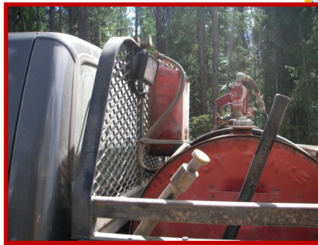
FIGURE 3. Hand-tank pump mounted on a headache rack.

Good practices observed included attaching hand tools to each machine and having a shovel, Pulaski and full and functional hand tank pump in each pickup truck. This often meant there were more hand tools on-site than workers.