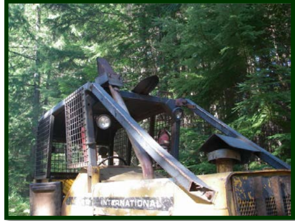
FIGURE 1. Shovel mounted on the top of a skidder.