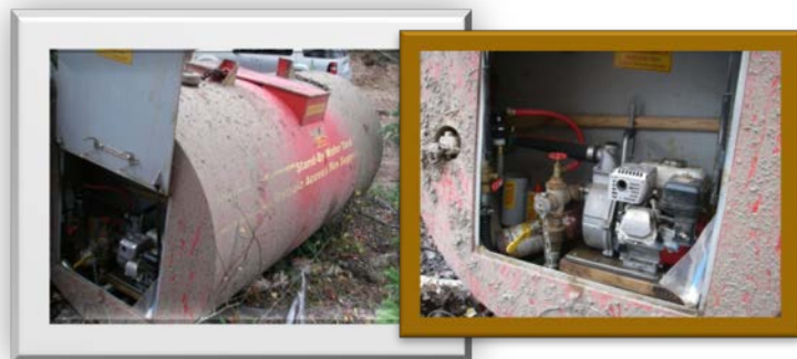
FIGURE 11 & 12. Portable water tank with a compartment for pump, hose and fittings ( left ). Close up of the pump in picture ( right ).

Determinations also give some indication of what is adequate or inadequate. Fire centre managers have made nine determinations involving fire-suppression systems, summarized below: