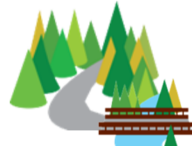
ROADS & BRIDGES