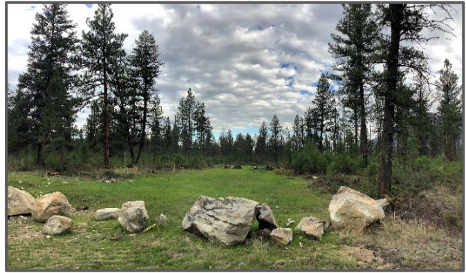
Figure 4. A road deactivated by blocking access, ripping the running surface and grass seeding to minimize surface erosion.

Canfor generally conformed with the Chief Forester's Standards for Seed Use to meet its legislated requirements under FRPA. As well, it adhered to its commitments under its FSP to employ climate change adaptation strategies for species selection. Canfor also demonstrated its commitment to reducing the wildfire risk in wildland urban interface 6 areas through the appropriate use of partial cutting and fire management stocking standards.