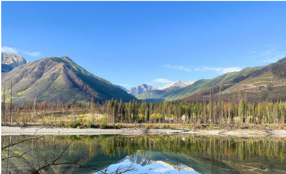
Figure 1. Riparian area and mid-slope salvage of burned timber in the Elk River Valley.

This report explains what the Board audited and the results. Detailed information about the Board's compliance audit process is provided in Appendix 1 .