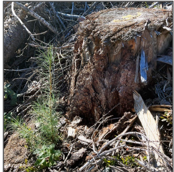
Figure 5. A tree planted next to a stump to provide shade and reduce the risk of cattle damage.