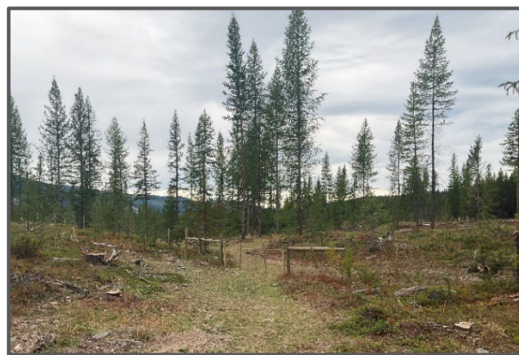
Figure 3. A cattle fence that was protected during harvesting activities.

Overall, Canfor demonstrated it had included adequate controls in its road management system and effectively monitored and maintained its roads.