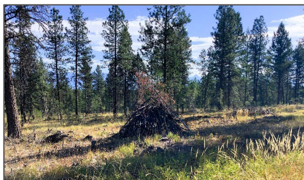
Figure 6. Hand piling of slash to reduce the fire hazard next to a residential area.

The auditor's field inspections revealed that in-block slash loading was below abatement thresholds 7 and no further treatment was required. Roadside slash was generally piled in safe locations and burned within the required period without damaging adjacent timber or other forest resources.